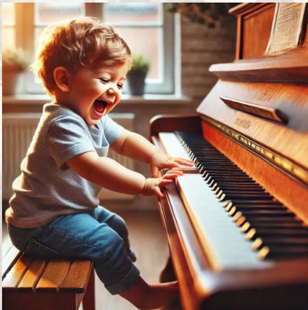
AI generated image